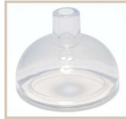
Neonatal and Infant Resuscitation Masks