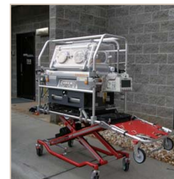
Ferno Powerflex Stretcher