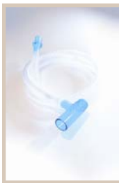
Neonatal Resuscitation Circuits