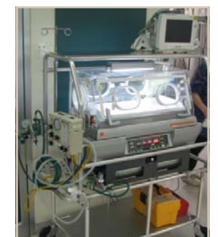
Ferno Custom Cart