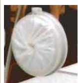
Iris Port Sleeves