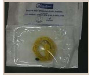
Reusable Skin Temperature Probes