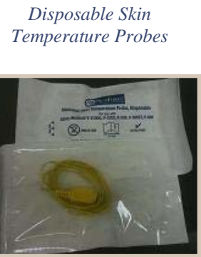
Disposable Skin Temperature Probes